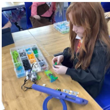
Making Lego models in our workshop.